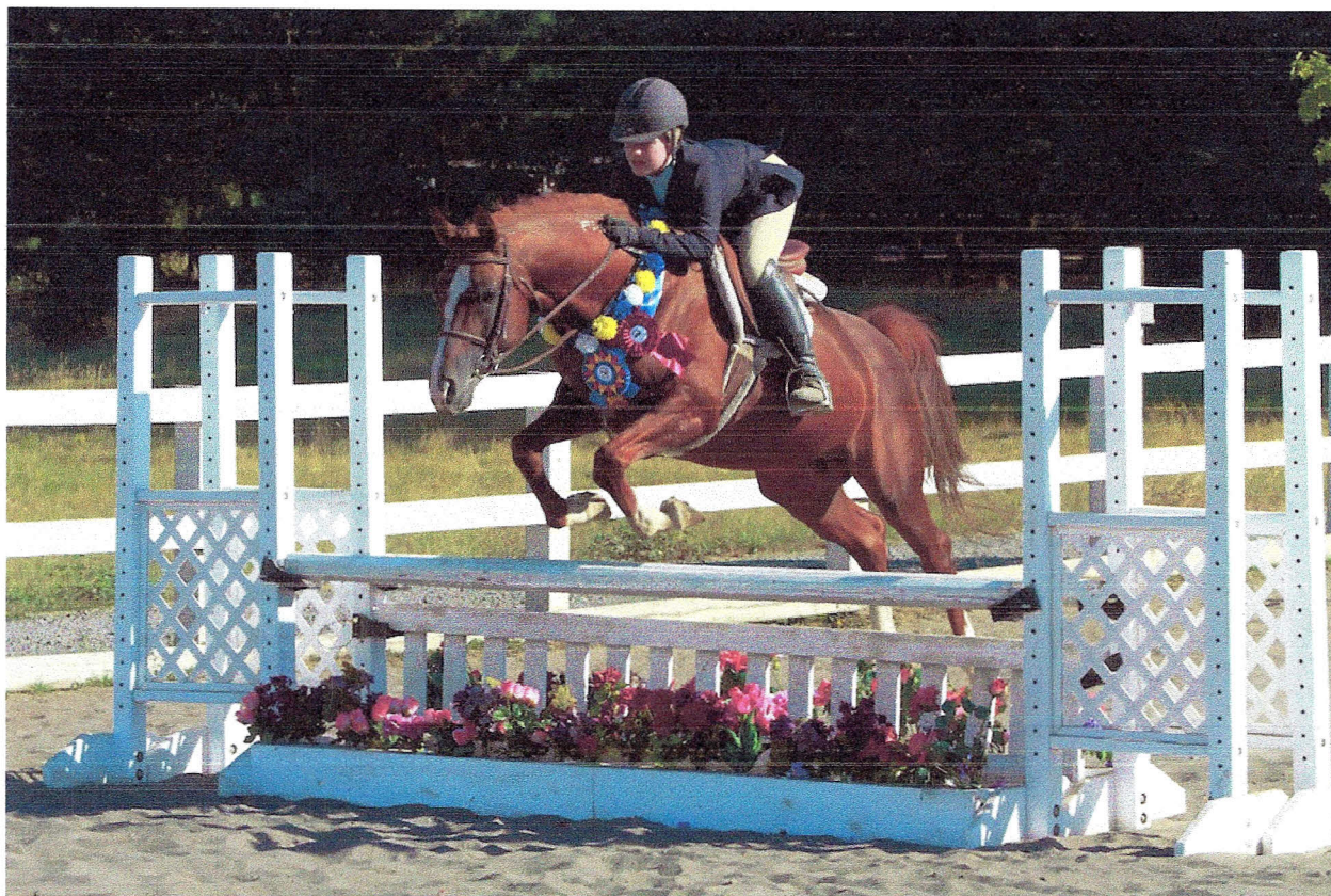
(Monogram X SS Annita)

Going The Distance in Hunters, Sport Horse, and Dressage, and siring great moving foals that can "move", are trainable, and are earning show records of their own as weanlings through 4-years old.