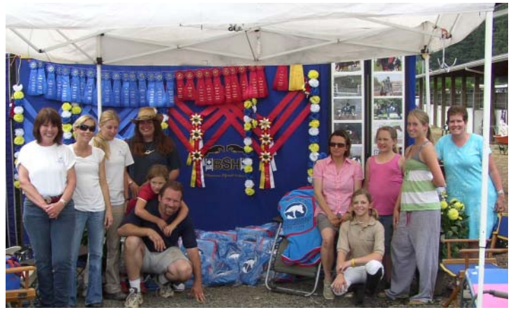
Bowan Sport Horses group pix after the Region IV show

Looking forward to seeing you all in the new year.