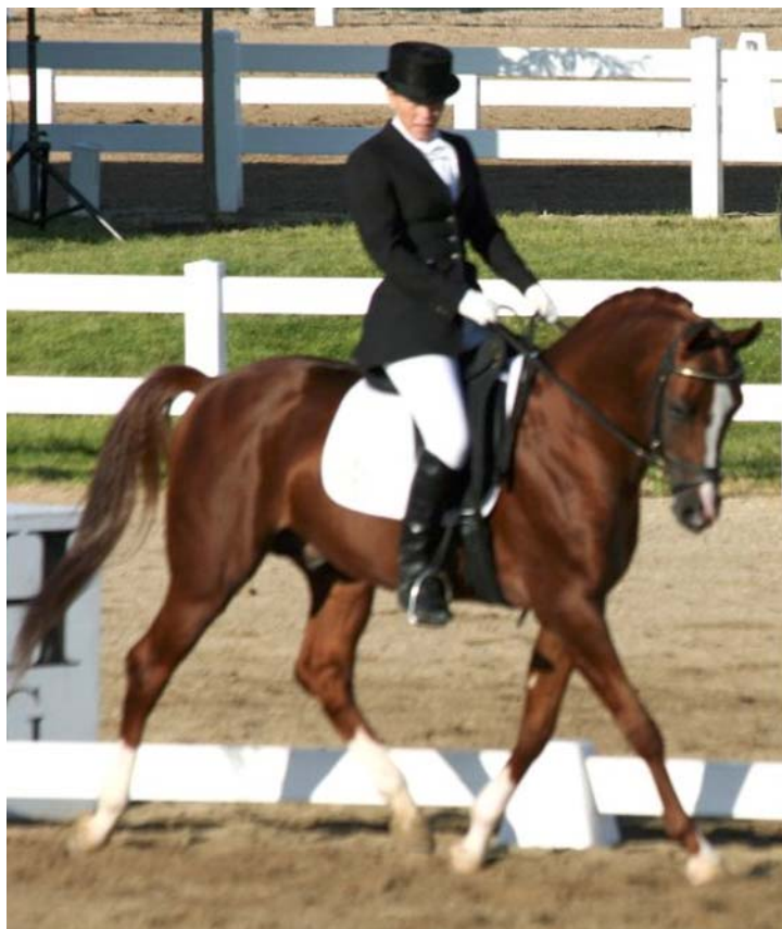
ANNAPOLIS+ (Monogramm X SS Annita) 15.2 hand 2003 Copper Metallic Chestnut Stallion

Both horses were happy to be back in their enormous stalls at Snyder Training Center. We were happy to arrive back home to our comfortable beds, our familiar surroundings, and to reflect on a wonderfully successful, and for at least one of us, "major trip."