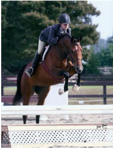
Lady Loria in Region 5