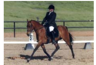
Simplyirresistible+/ (Dam of Indiannapolis)