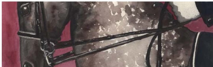
"Dressage" Watercolor painting by Holly Lenz, 2001