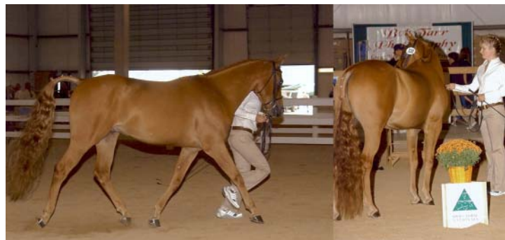
Red at the 2008 Sport Horse Nationals in Idaho