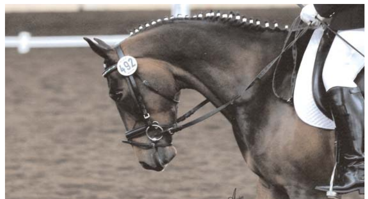
Paladin and Penny

The 2010 Region 4 Championship Show will be held June 20 - 26th. We hope you will understand our goal of keeping this show and our Region alive and well. We look forward to having you join us to celebrate our horses at our Regional Horse Show.