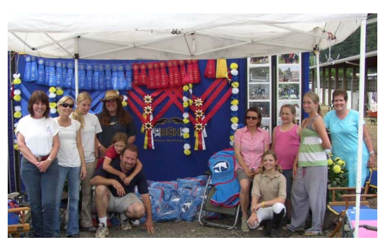
Bowan Sport Horses group pix after the Region IV show

Looking forward to seeing you all in the new year.