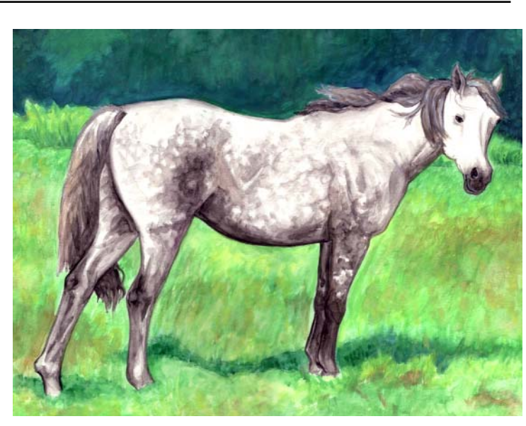
Dawn, 2006 watercolor by Holly Lenz