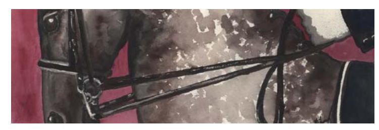
"Dressage" Watercolor painting by Holly Lenz, 2001